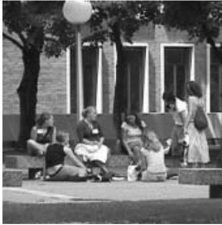
New students relax and get to know each other during a lunch break at their two-day Freshmen Orientation Session.