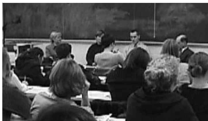
Students ask career-related questions of the panelists.