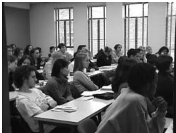
Undergraduates gain advise on entering the job market.